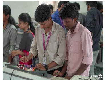
Sample Award receiving photos: