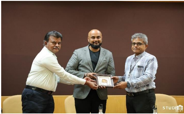
Honoring the Chief Guest