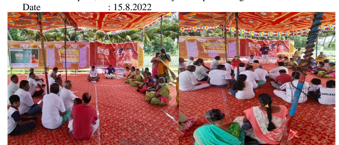
GramaSabha Meeting at Chinnampalayam village

(ii) Name of the Activity : GramaSabha Meeting at Chinnampalayam, Kanjampatti, Makkinaickenpatti, Thenchittur and Unjavelampatti villages