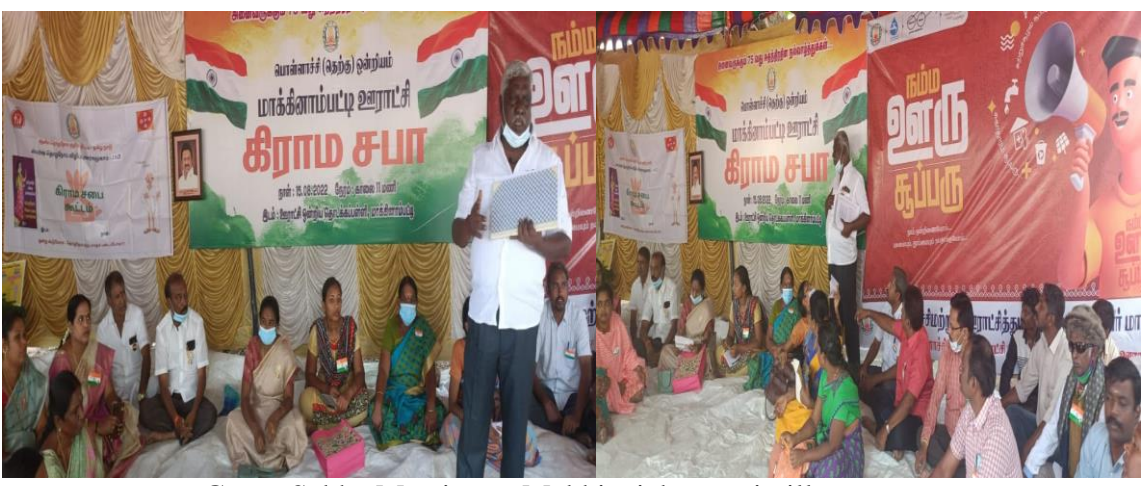
GramaSabha Meeting at Makkinaickenpatti village