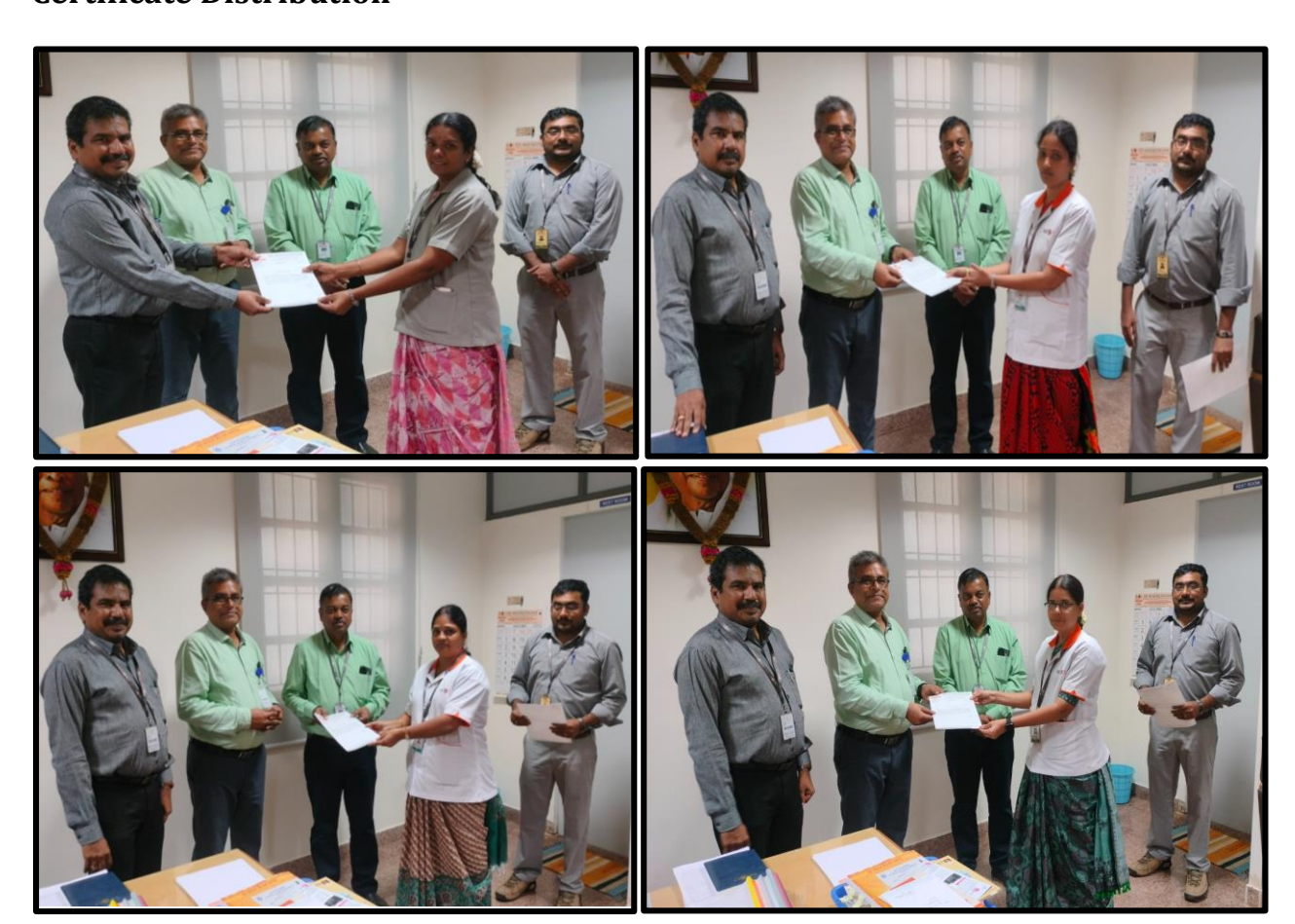
Certificates of Appreciation were presented to the resource persons by the administrative team members.