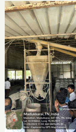
Industrial Visit to TechNew Building Products, Madukkarai, Coimbatore for Third year B.E. Civil Engineering students on 25.11.2023 .