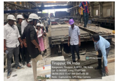
Industrial Visit to Teemage Precast Unit at Kangeyam for Final year B.E. Civil Engineering students on 04.08.2023 .