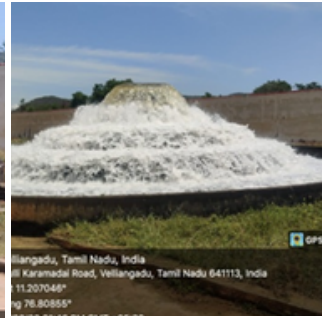
Industrial Visit to Velliangadu Water Treatment Plant, Mettupalayam, Coimbatore for Third year B.E. Civil Engineering students on 01.08.2023 .