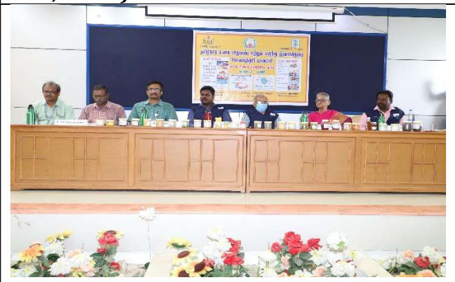
Dignitaries on the dais

World Food Safety Day 2022 Celebrations: 08.06.2022 (Venue: Electrical Seminar Hall, MCET)