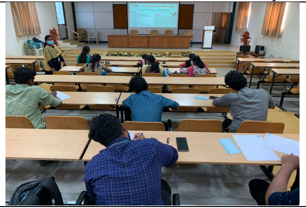
Students' ideas considering technology towards the consumers