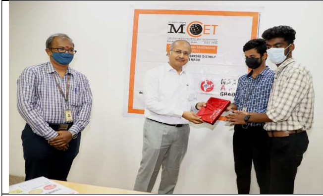
Second Prize Winners