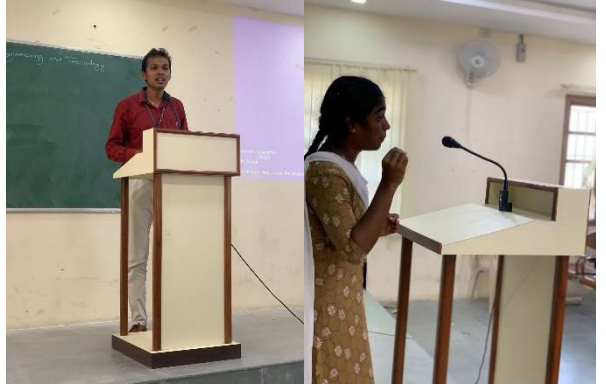
Students had put their thoughts, insights, humour and delivered the speech of consciousness which was fluent, erudite and articulate while being unscripted