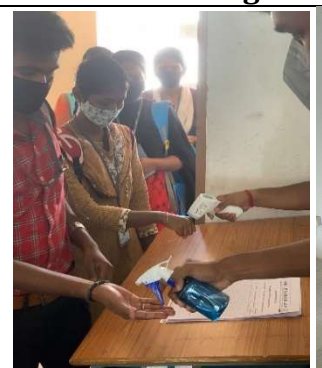
SOP & Registration

Drawing competition: 23.02.2022 (Venue: A428 Drawing Hall, MCET)