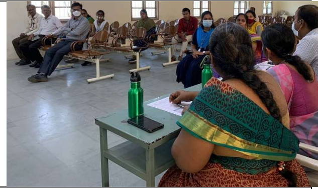
Juries and guests providing feed back to the participants

Drawing competition: 23.02.2022 (Venue: A428 Drawing Hall, MCET)