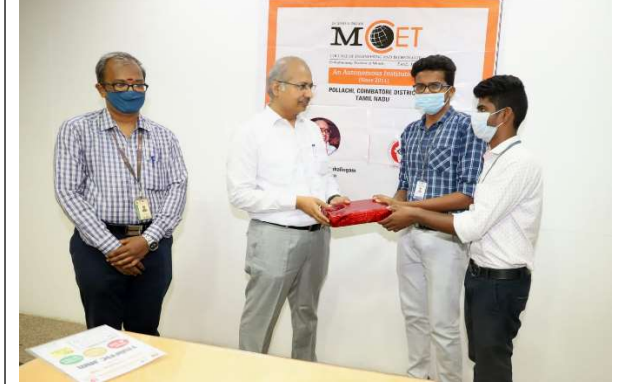
Third Prize Winners

World Food Safety Day 2022 Celebrations: 08.06.2022 (Venue: Electrical Seminar Hall, MCET)