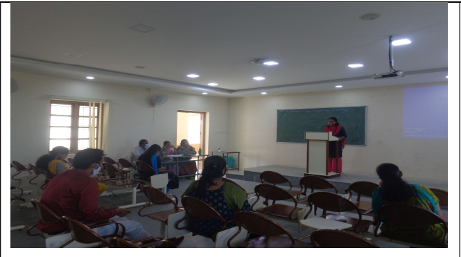
To instil confidence in the students and encourage them to learn the art of public speaking,