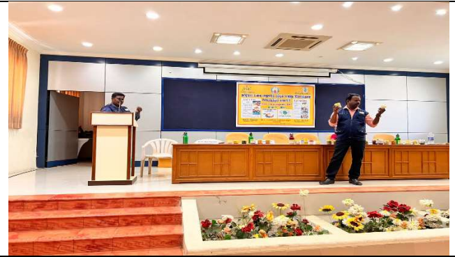
Food Safety officeres have explained the how to detect the adulteration by rapid tests