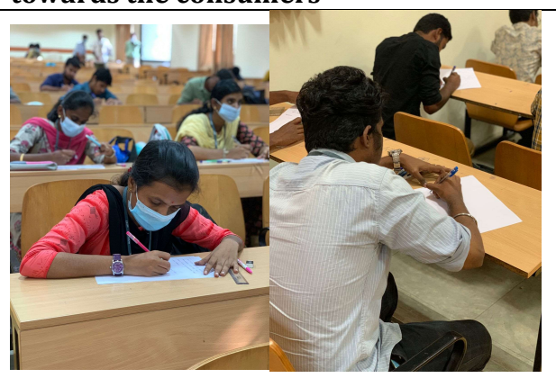
students showed up their knowledge in the | Showing how engineers can contribute it enormously comprising the topics

Elocution Competition: 23.02.2022 (Venue: A315 Seminar Hall, MCET)