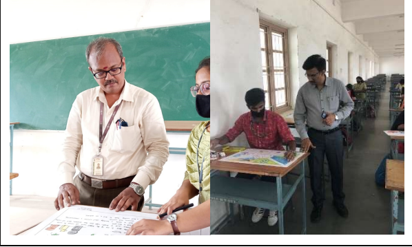
Participants in the competition enthusiastically depicted the social responsibility through their colourful paintings. Participants explained about their presentations.