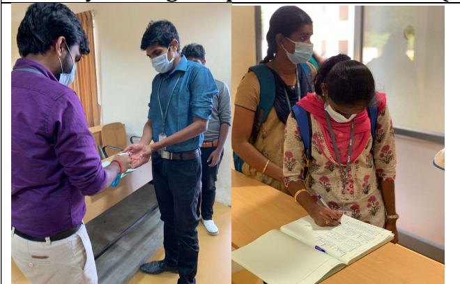
SOP & Registration

Essay writing competition: 22.12.2021 (Venue: Mechanical Seminar Hall, MCET)