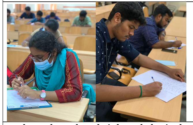
way they see this enthusiastic world