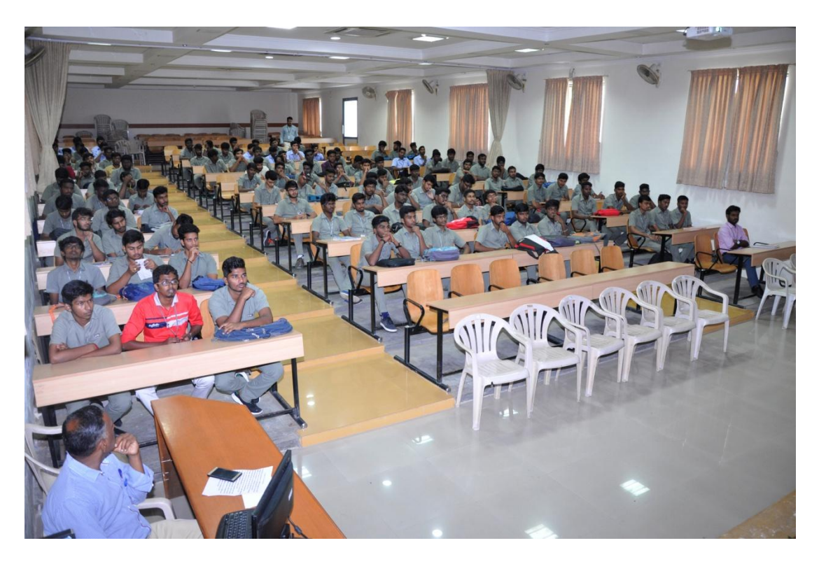
Glimpses of Guest Lectures