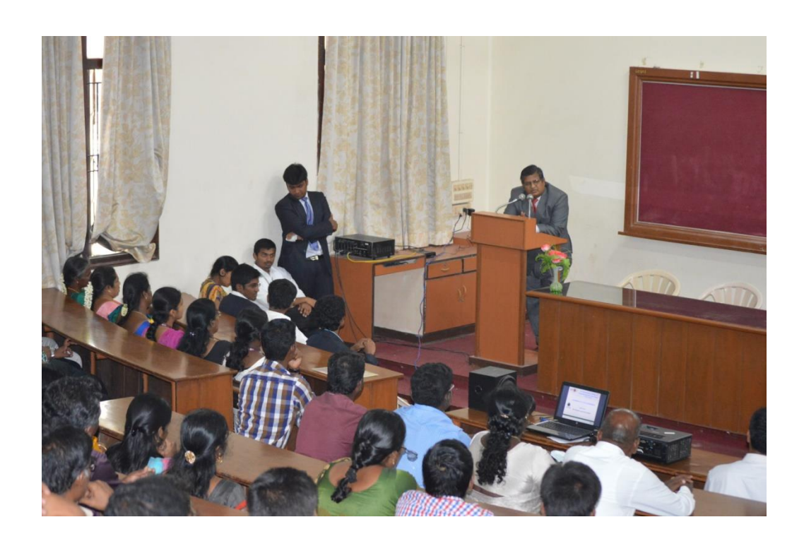
FIRST YEAR ORIENTATION PROGRAM