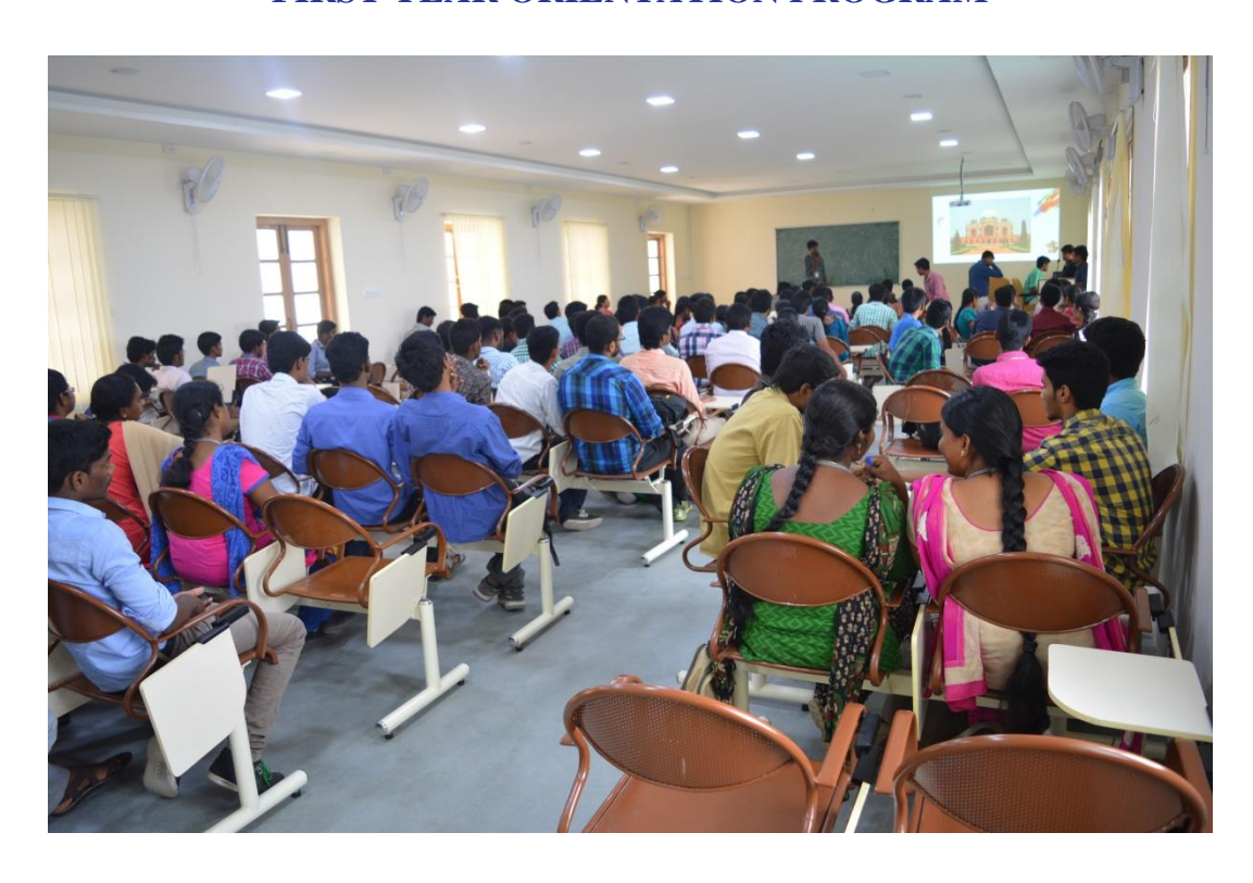
STUDENTS PARTICIPATION AT ENGINEERS DAY EVENT – VARNAM 360