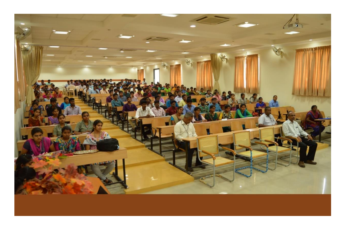
Student Participants in the lecture on How to Excel Symposium