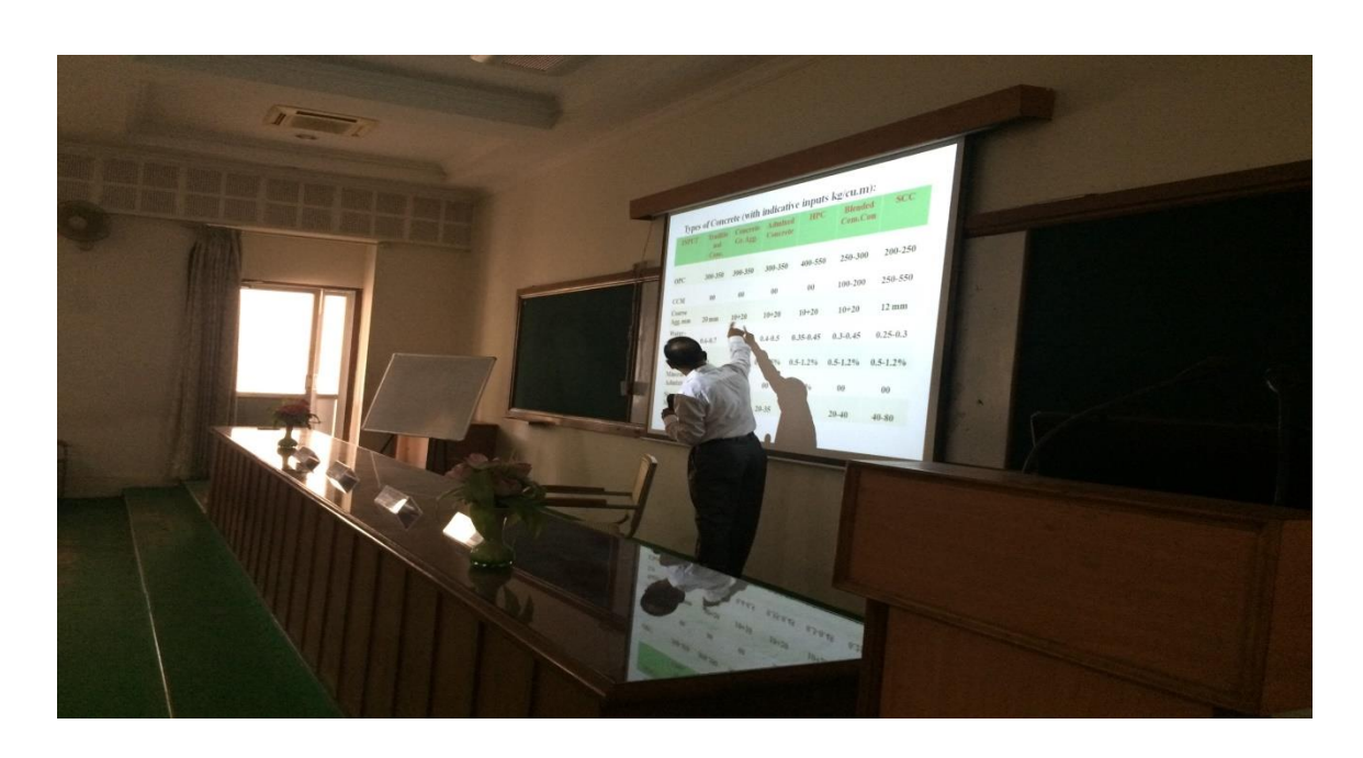
STUDENTS BEING ADDRESSED BY SPEAKER AT BEAVERS INAGURATION